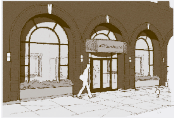
The Bank will open this fall at 2400 Broadway, Redwood City. Architectural rendering of the new Mid-Peninsula Regional Office.